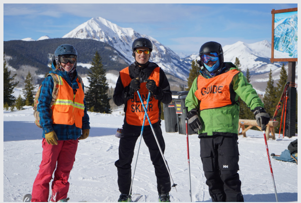
Operation B.A.S.H. (Blind Awesome Skiing Heroes) brought a group of veterans with visual impairments to Crested Butte this winter.