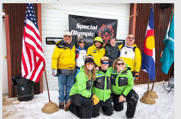
A group of local athletes from the Gunnison Valley headed to Copper Mountain to compete at the Special Olympics and came back with lots of hardware!