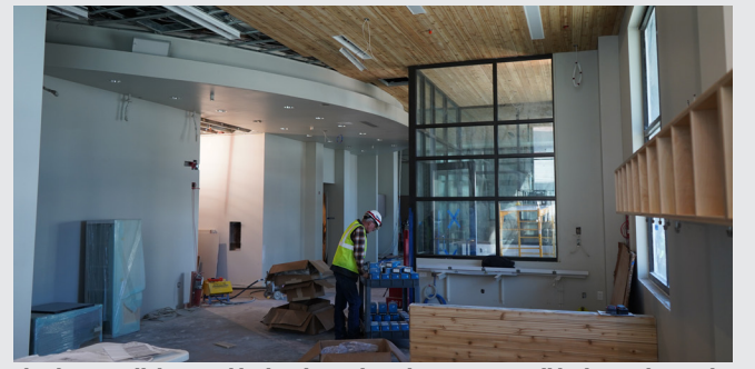
The donor wall designed by local metalsmith Ben Eaton will be located near the main entrance and reception.