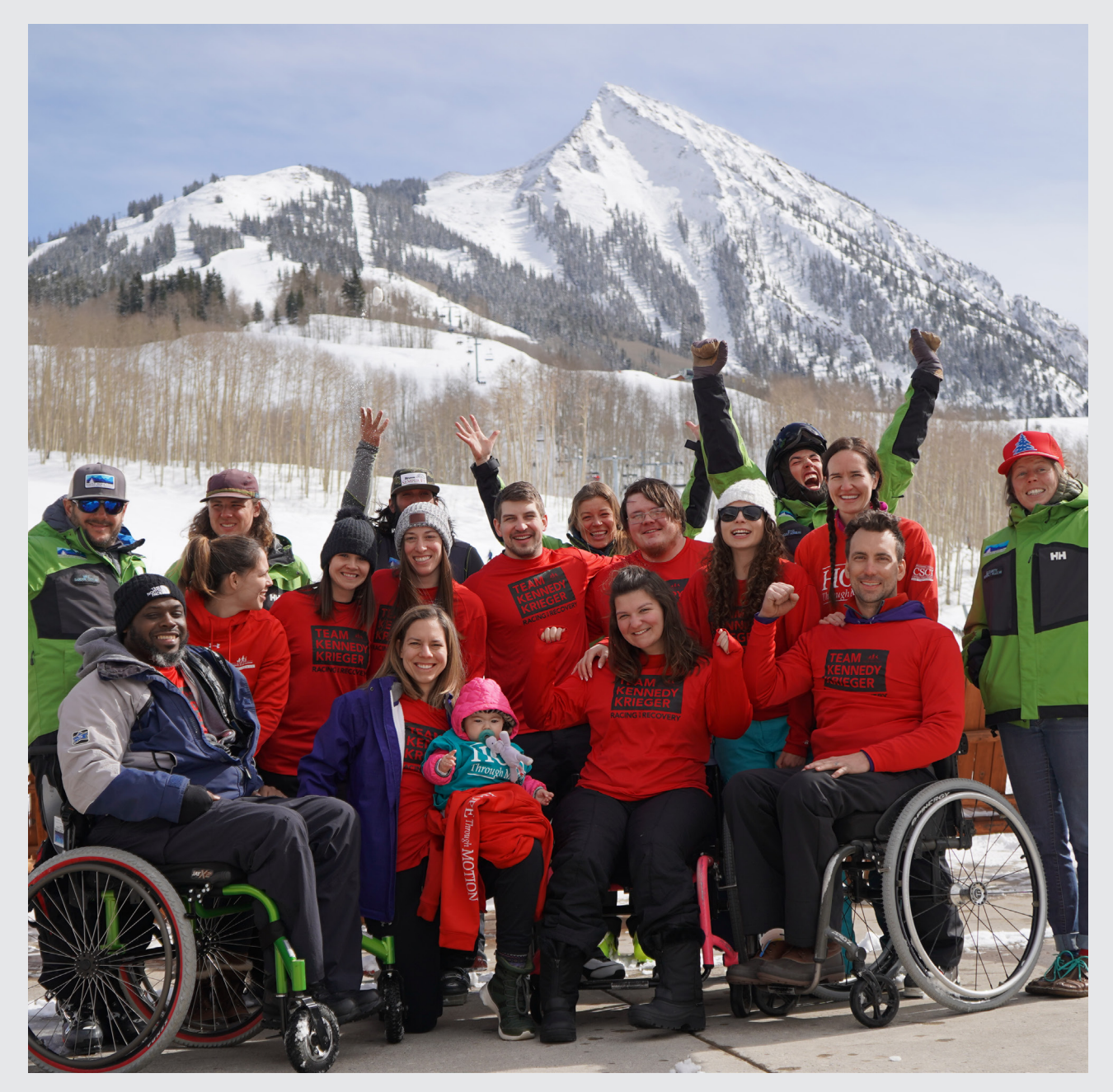
The Kennedy Krieger Institute brought a group of participants with spinal cord injuries from the Baltimore area to CB to push their boundaries.