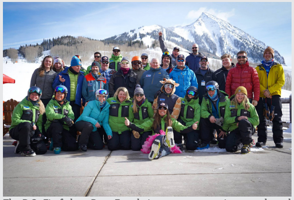
The D.C. Firefighter Burn Foundation spent a sometimes rowdy and always adventurous week skiing and ice climbing.