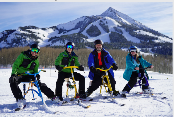
\ensuremath{\mathsf{ASC}} instructors and Wounded Warrior Project participants rock the skibikes at the top of Prospect.