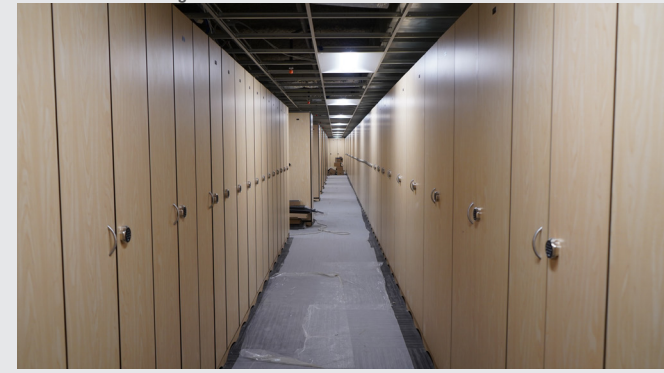
The lockers, located in the basement, are available for seasonal rentals