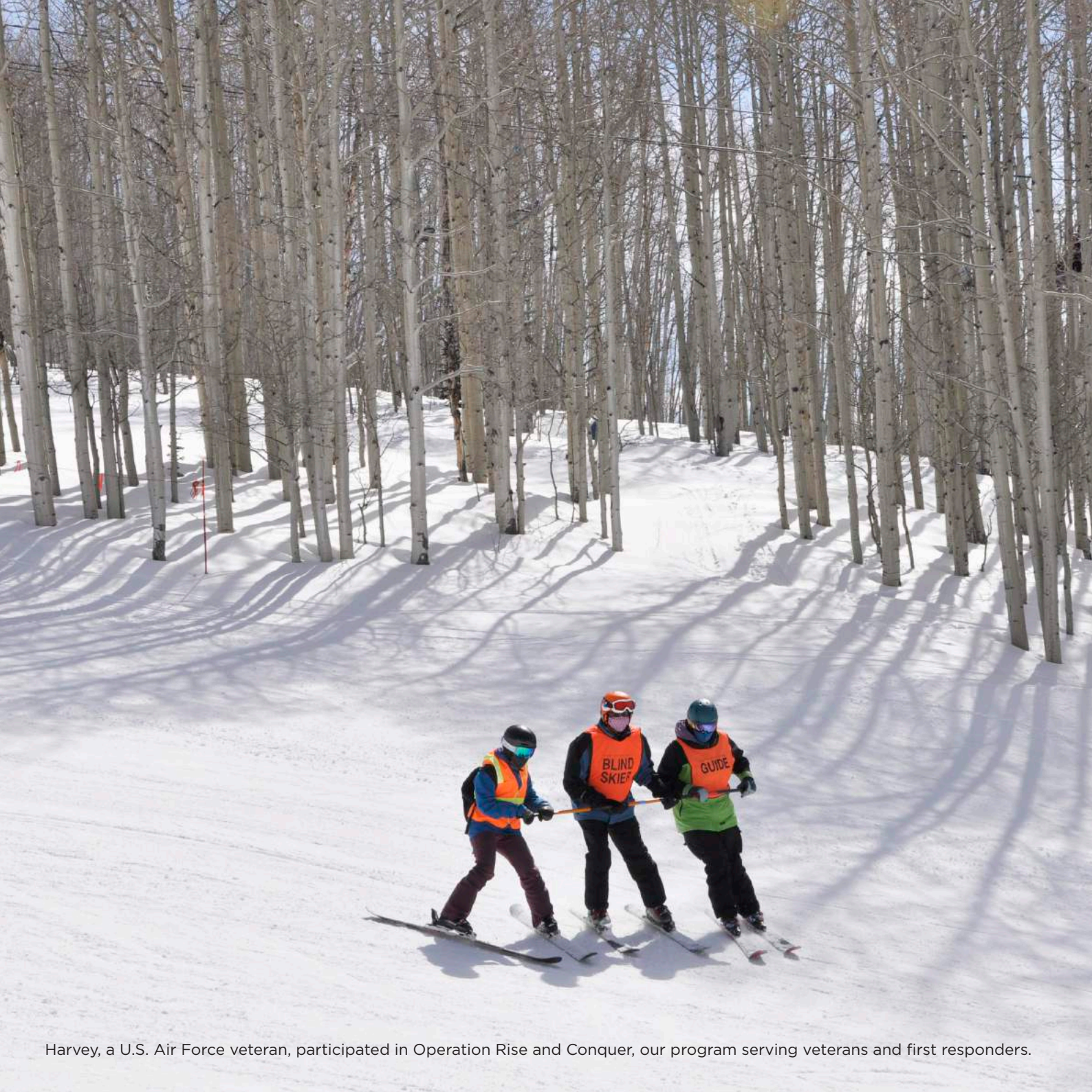
Harvey, a U.S. Air Force veteran, participated in Operation Rise and Conquer, our program serving veterans and first responders.