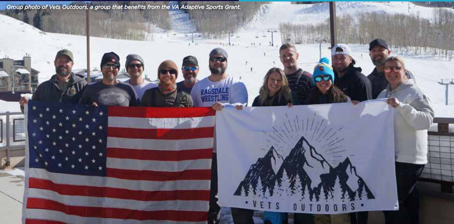
Group photo of Vets Outdoors, a group that benefits from the VA Adaptive Sports Grant.

And then I reply, “I love being a grant writer.”